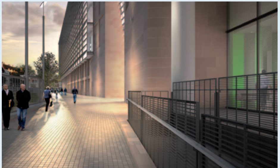
Above: A view of the new route linking St Pancras International to Ossulston Street to the south of the UKCMRI building.

UKCMRI will contribute £360,000 to help fund two Safer Neighbourhood police officers for three years. And we will contribute £130,000 to community safety measures in the local area, including CCTV.